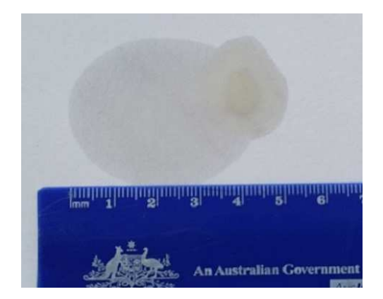
After 2 hours: