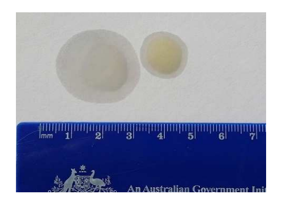
After 1 hour: