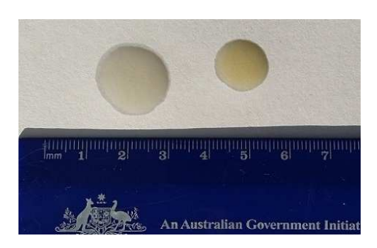
After 10 minutes:

On left – essential oil, right – CO2 extract.